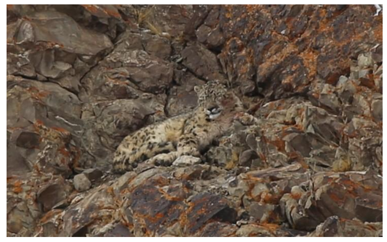
Snow Leopard - Rumbak Valley