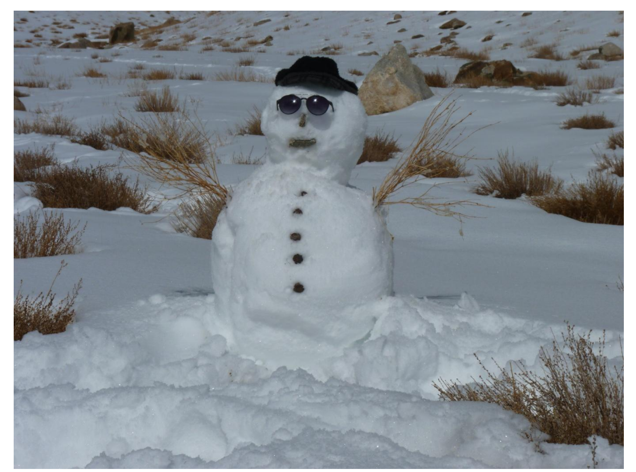
Frosty the Snowman and Bharal, Argali, Urial