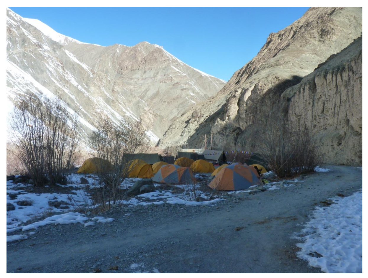
Our tents are the orange/blue ones