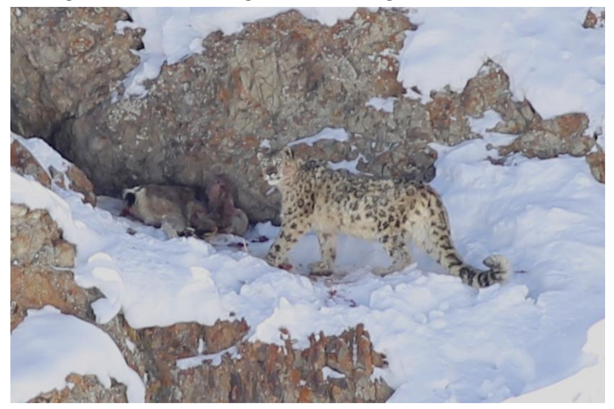
Snow Leopard with Blue Sheep carcass

The evening meal was in a tent which was warmed by an oil fire. We eventually crawled into our sleeping bags at around 21:30 all very, very happy after an eventful and super first day in Hemis NP. Later that night we all heard a dog Red Fox barking.