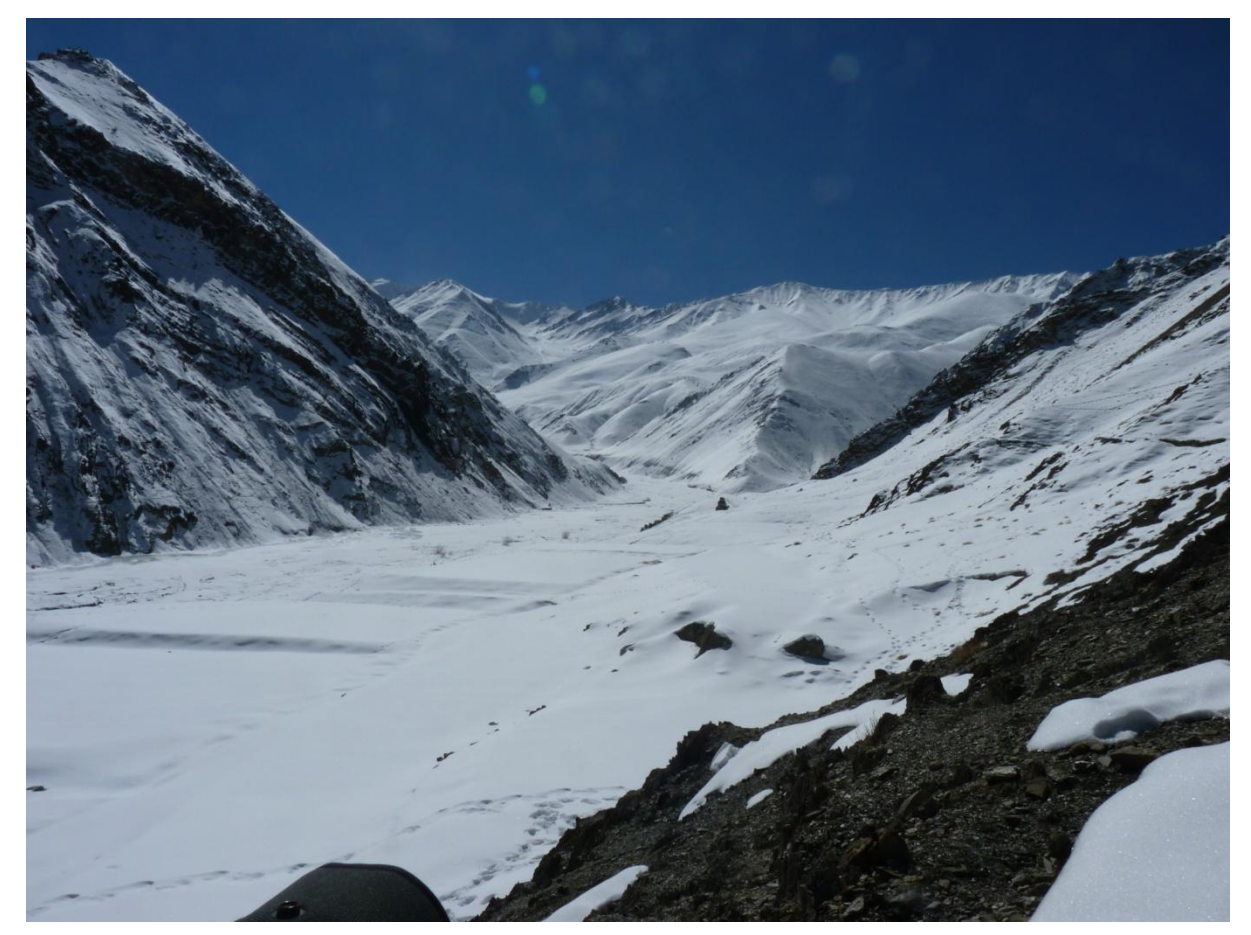
Rumbak Valley looking toward Yurutse.