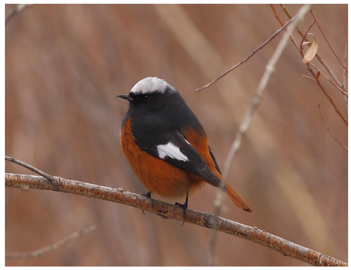
White-winged Redstart above, the camp Yak below.