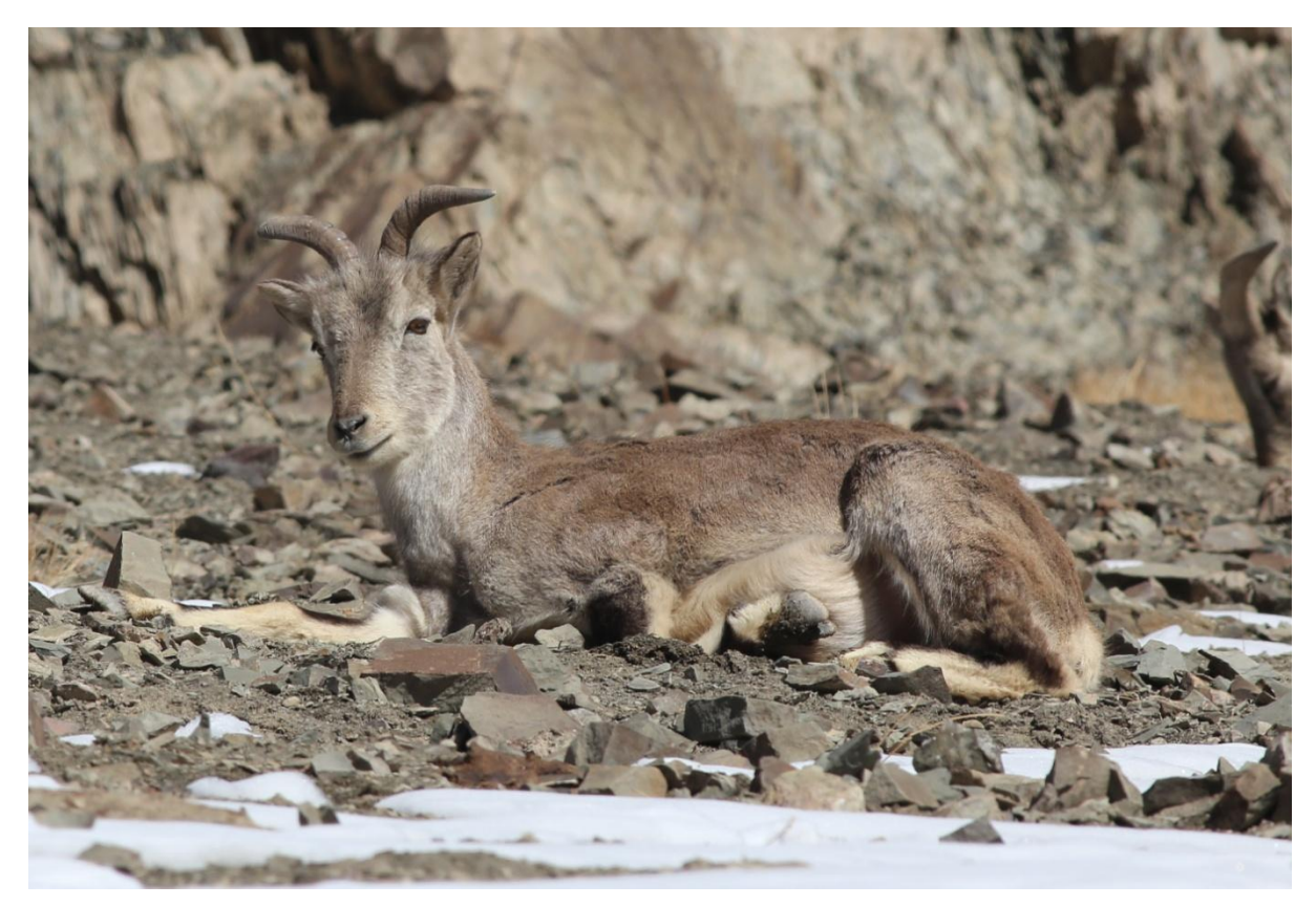
Blue Sheep ewe

above the camp in Husing Valley. So obviously our plan was to go up Husing Valley to look for the Snow Leopards but early afternoon just wasn't a good time - we would go up in a couple of hours.