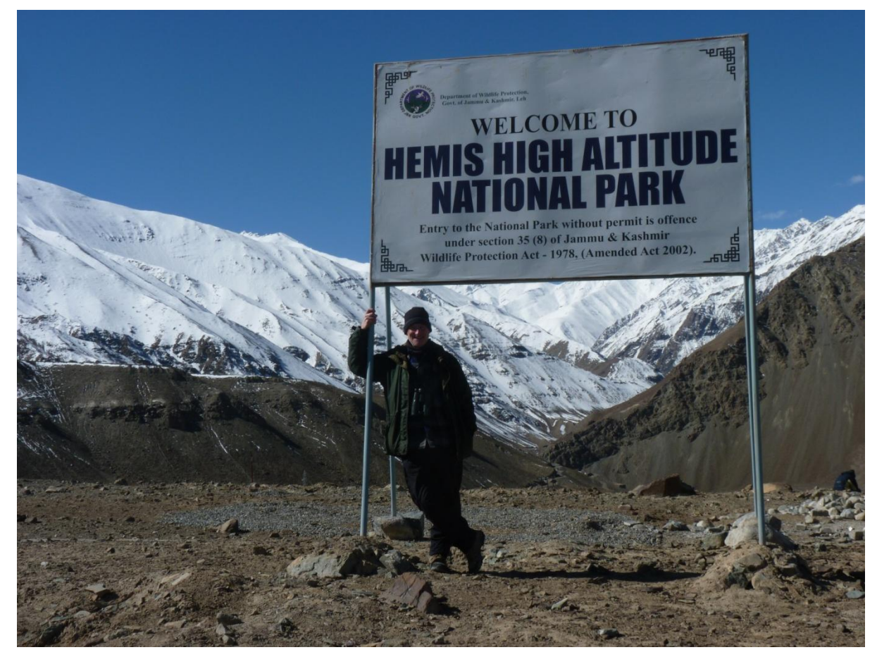
Me at the entrance gate to Hemis NP.

As our bags were getting loaded up we were told that a Snow Leopard had been hanging around a low rocky outcrop all morning and seemed to be settled there. As you can imagine we just wanted to go and go fast, we were told to keep walking along the track until we came to the camp and then plan it from there as the leopard was up the valley a few kilometres further. Myself and Tim just walked as fast as we could, given the altitude, not speaking but both silently praying the Snow Leopard would remain where it was until we got there. We got to the tented camp in 30 minutes - not bad going really! The equine train arrived after a bit and our bags were unloaded, we already had our binoculars with us, we had a quick cup of tea, grabbed our scopes and tri-pods and were ready to set off. Gurmet just said yes you must go just follow the track along the Rumbak Valley until you come to the people watching the leopard! So Tim and myself just hoofed it up the valley, not taking in the