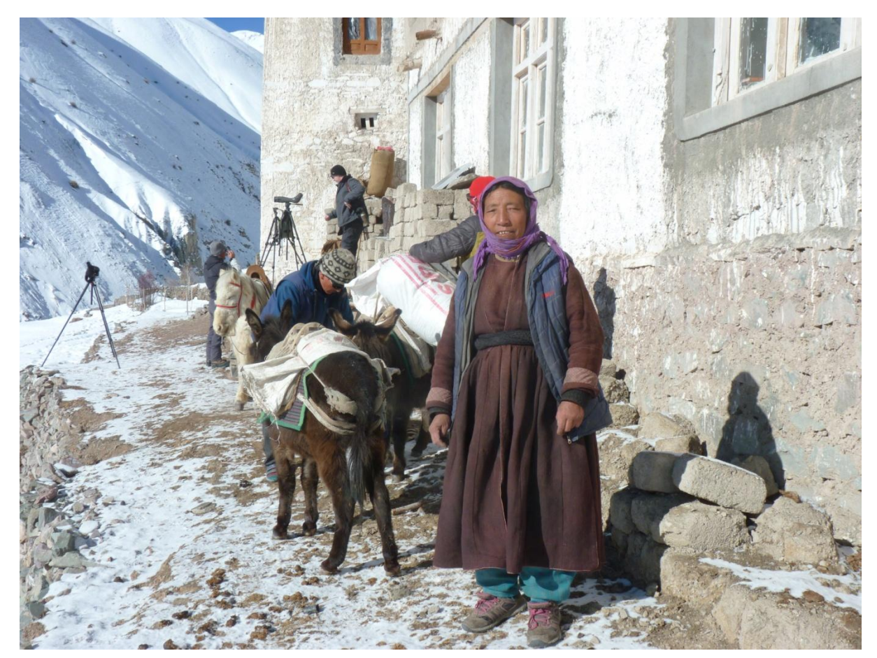
Our host, Yurutse Homestay