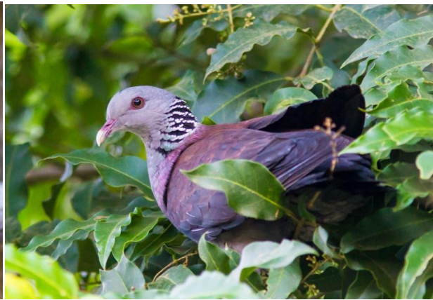
Nilgiri Wood Pigeon