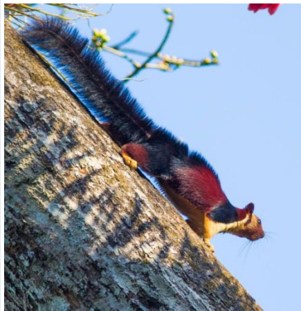
Malabar Giant Squirrel