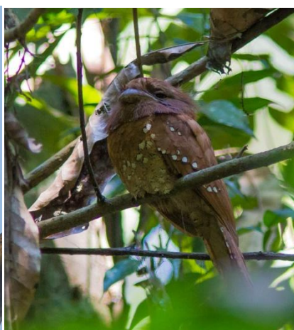
Sri Lanka Frogmouth