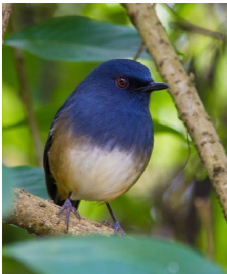
Nilgiri Blue Robin

After a quick breakfast we headed to the nearby Cairnhill Reserved Forest, basically a pine plantation with abundant dense undergrowth. We spent much time walking through the fairly uniform habitat, seeing little but an enormous Gaur which we, alarmingly, almost bumped into as we walked around the bend in the narrow trail. We made a hasty retreat and waited for it to pass, taking a few snaps in the meantime. We were almost back at the entrance to the reserve when we at last found a Nilgiri Blue Robin. We eventually managed good views of this skulker and we surprised when it was joined by a stunning Black-and-Orange Flycatcher. After nearly two hours of searching we found two target birds within five minutes of each other and right next to the entrance gate!