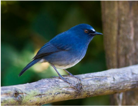
White-bellied Blue Robin