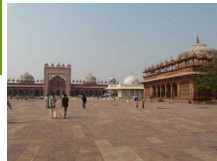
Fatehpur Sikri © J Dale