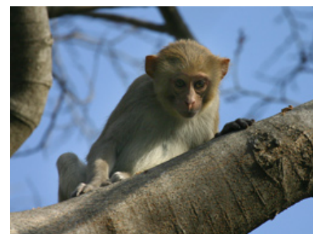
Rhesus Macaque