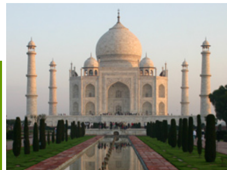
Taj Mahal

Experience daily life in a Bishnoi community village.