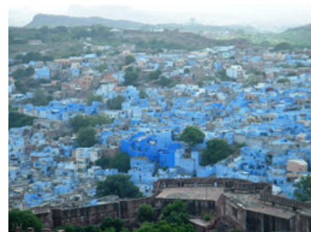
Jodhpur from Mehrangarh Fort