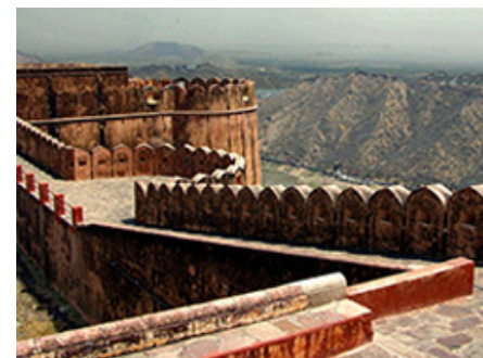
Amber Fort, Jaipur