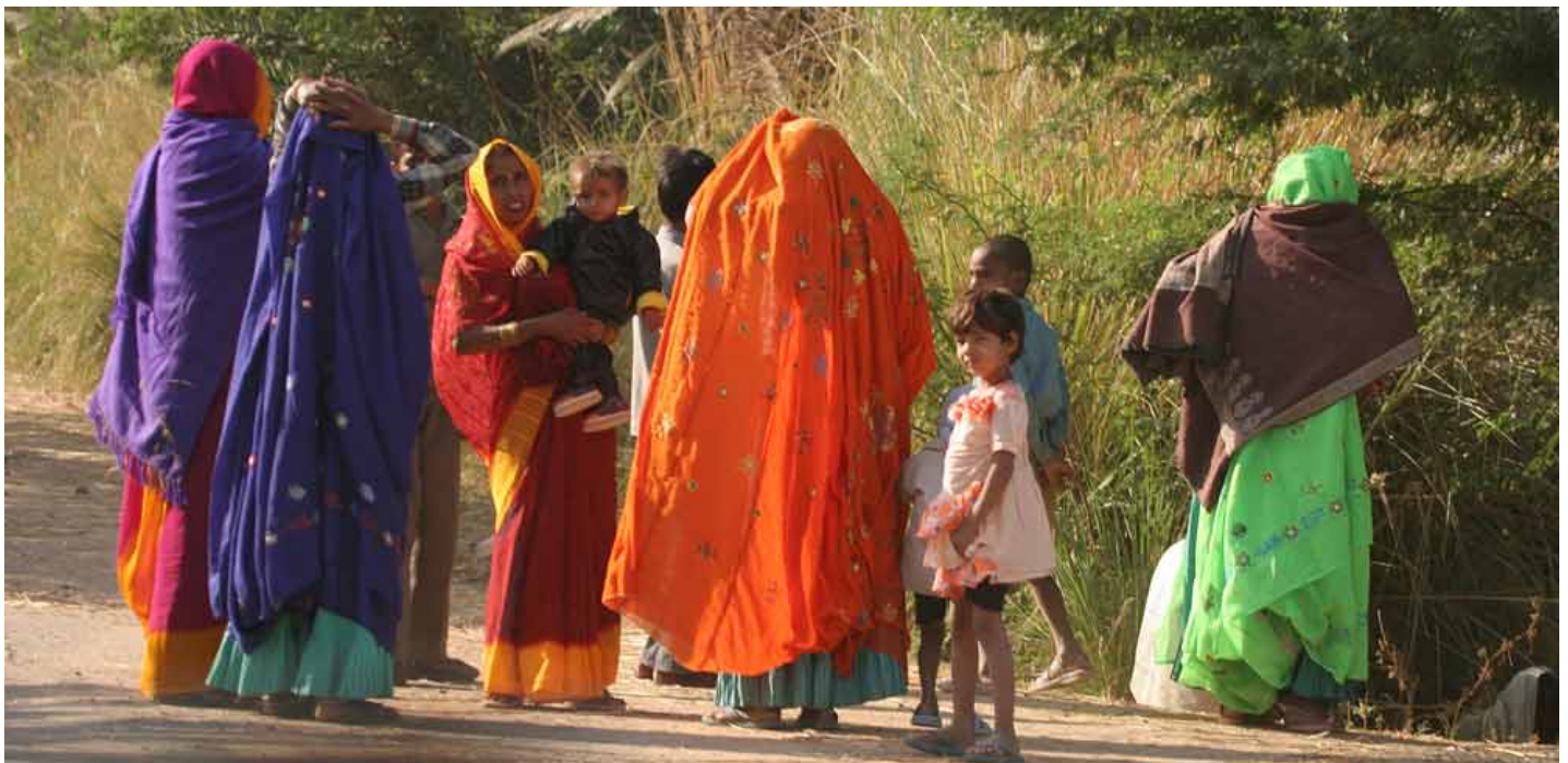
Vivid colours of India

Reg. no. 5522066. Registered Office: 25 Sapley Road, Hartford, Huntingdon, Cambridgeshire, PE29 1YG, UK