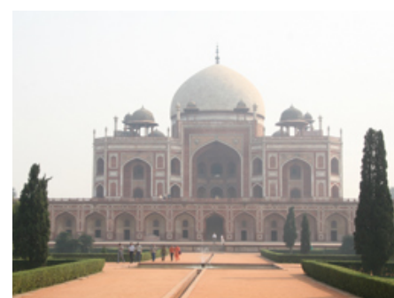
Humayun's Tomb