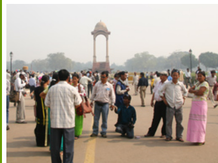
India Gate