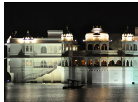
Lake Palace, Udaipur