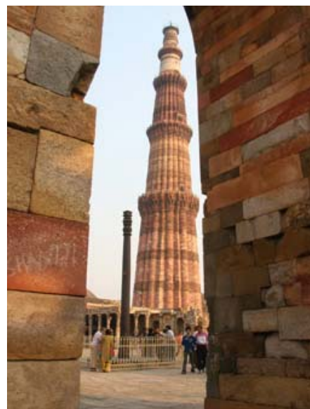
Qutub Minar, Delhi

Pre-travel information including how to apply for your tourist visa.