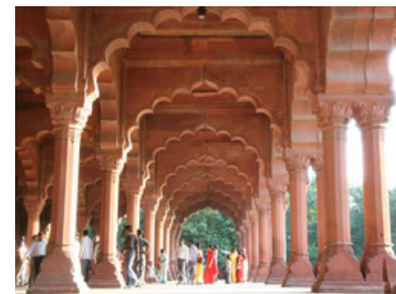
Dewan-i-Aam, Delhi Red Fort