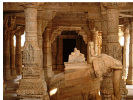
Ranakpur Jain Temple