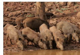
Wild Boar