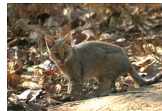
Jungle Cat

Price per person (valid till 31 March 2012) on twin-share basis for TWO travelling: £410 (mid budget), £430 (standard), £515 (deluxe).