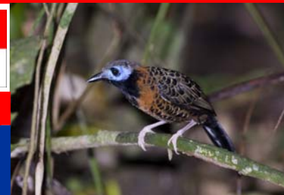
Ocellated Antbird