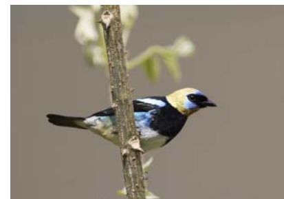
Golden-hooded Tanager

Best time to visit: Depends on interest (Nov – March/April for birdwatching)