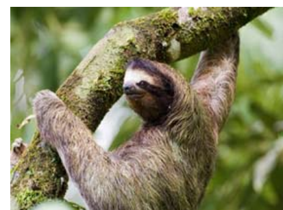
Brown-throated Three-toed Sloth