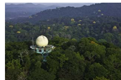
Canopy Tower