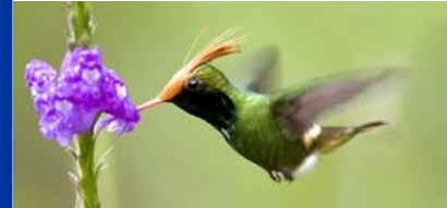
Rufous-crested Coquette