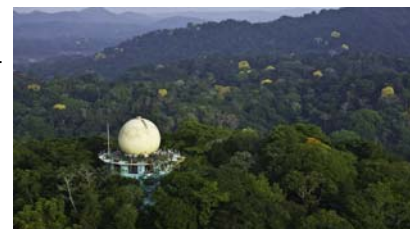
Canopy Tower