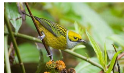
Silver-throated Tanager