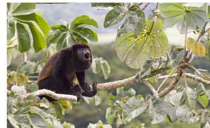
Mantled Howler Monkey

Best time to visit: Depends on interest (Nov – March/April for birdwatching)