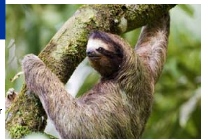
Brown-throated Three-toed Sloth