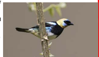
Golden-hooded Tanager