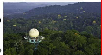
Canopy Tower