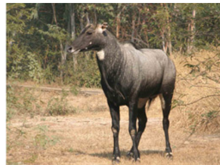
Nilgai © R F Porter