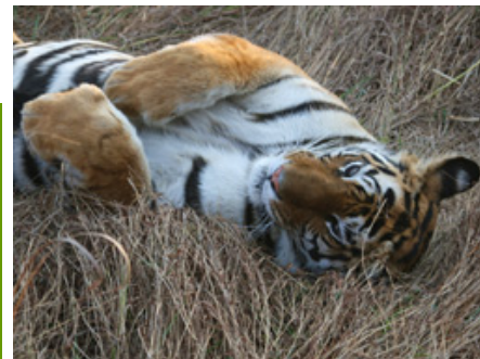
Bengal Tiger at Kanha

Mammals likely to be seen: Bengal Tiger, Indian Bison (Gaur), Swamp Deer, Nilgai, Sambar Deer, Spotted Deer, Wild Boar, Jungle Cat, Hanuman (Common) Langur, Rhesus Macaque. Leopard, Wild Dog (Dhole) and Sloth Bear are present at Kanha but require a little more luck to see them.