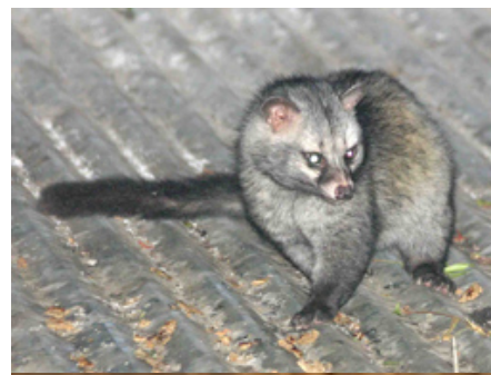
Indian Palm Civet © R F Porter