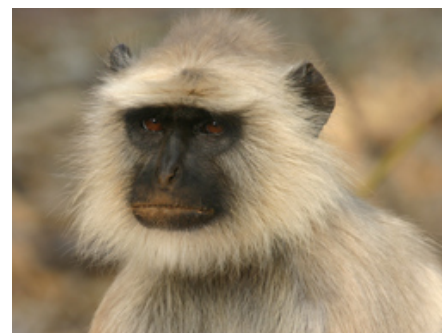
Common Langur