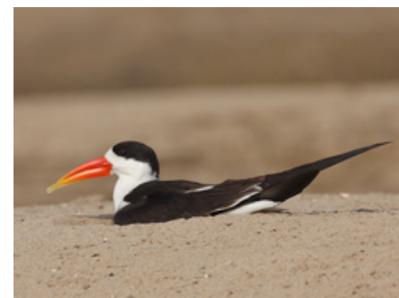
Indian Skimmer

In the morning enjoy a boat trip with the resident guide along the River Chambal to