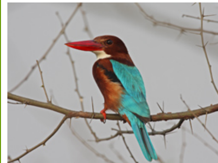
White-breasted Kingfisher