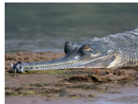
Gharial, Chambal © C Bradshaw