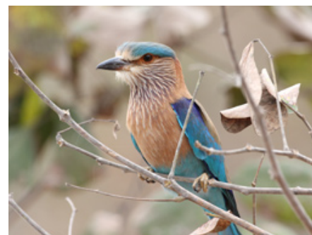
Indian Roller