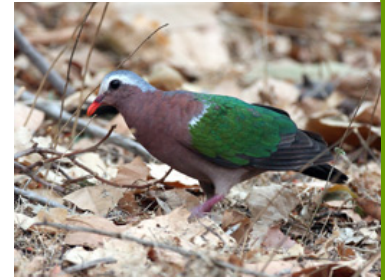
Emerald Dove