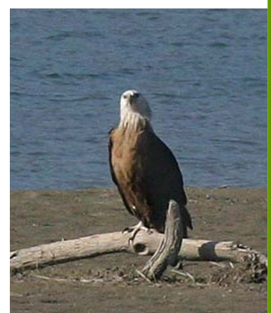
Pallas's Fish Eagle

Price per person (valid till 31 March 2012) on twin-share basis for TWO travelling: £595 (mid budget), £610 (standard), £670 (deluxe).