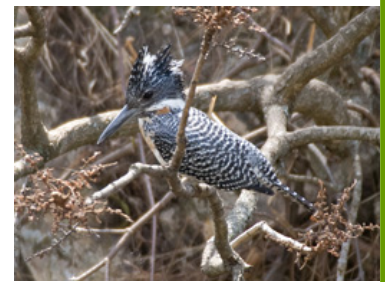
Crested Kingfisher

Spend the morning birding with your guide at Kumeria along the Kosi River. Species seen here include Wallcreeper, Brown Dipper, Spotted and Little Forktails on the river and White-crested Laughingthrush in the forests. Then drive back to Delhi (6 – 7 hours) to arrive at Delhi International Airport in plenty of time to connect with your international flight home (to be booked by you directly). If you have a morning flight we can arrange for a night in Delhi (on extra payment). (B) Tour ends.