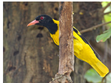
Black-hooded Oriole