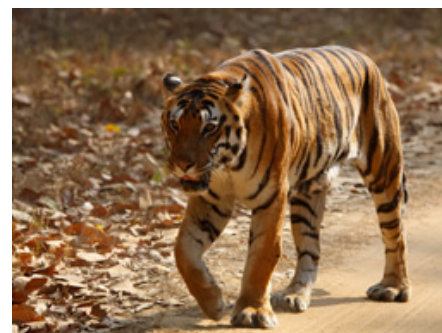
Bengal Tiger

On this day we have included a departure transfer to the airport to connect with your international flight home (to be booked by you directly). (B) Tour ends.