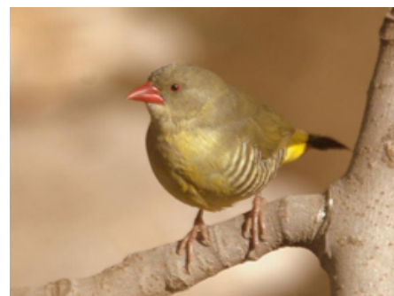
Green Avadavat