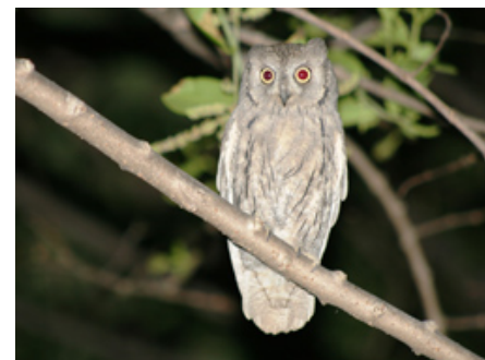
Pallid Scops Owl