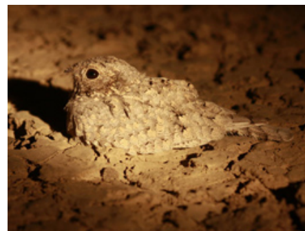
Sykes's Nightjar

The booking of this itinerary is with Wild About Travel and their booking terms and conditions apply.