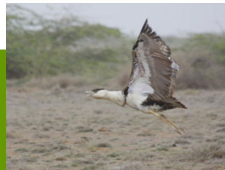
Great Indian Bustard

Meals: Breakfast, packed lunch and dinner