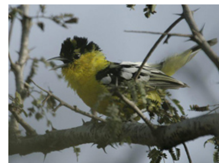
Marshall's lora