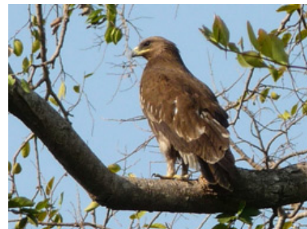
Lesser Spotted Eagle