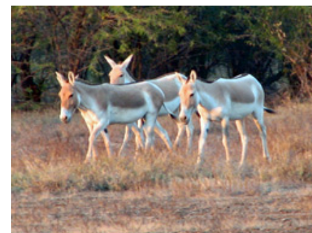
Asiatic Wild Ass