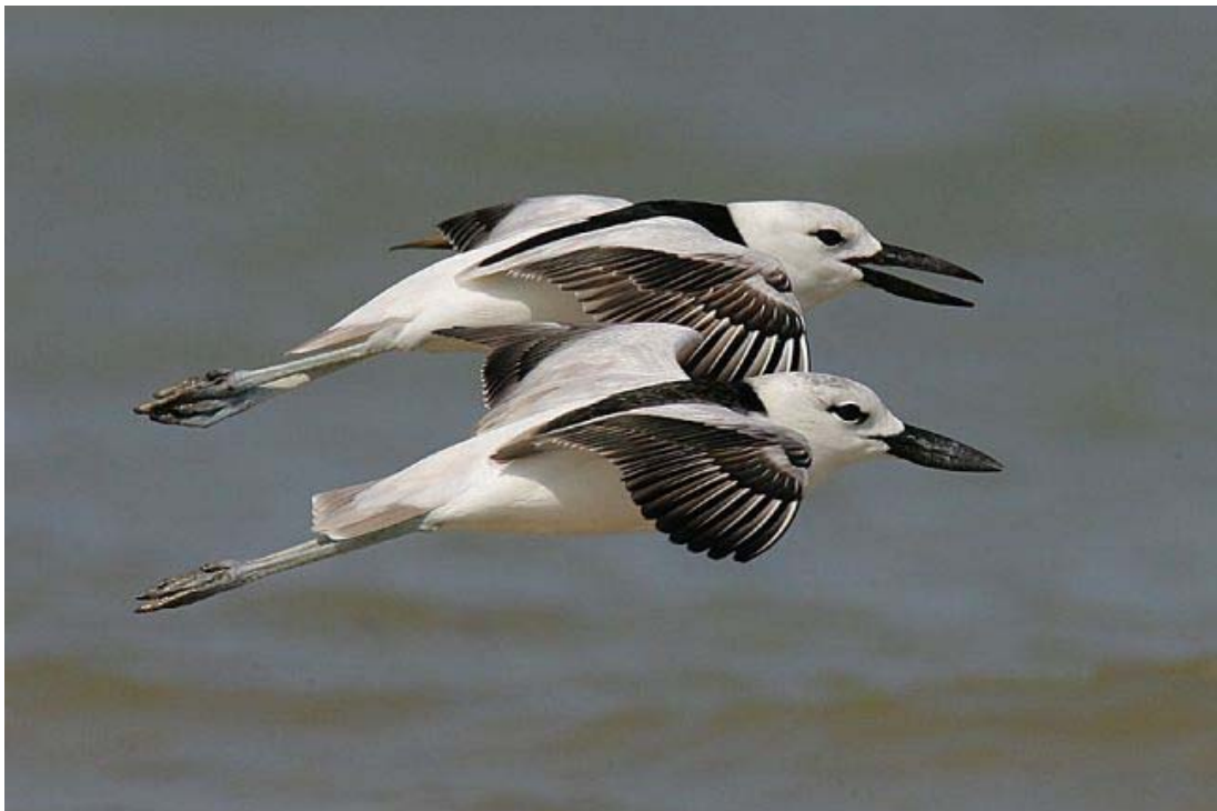
Crab Plovers

Reg. no. 5522066. Registered Office: 25 Sapley Road, Hartford, Huntingdon, Cambridgeshire, PE29 1YG, UK