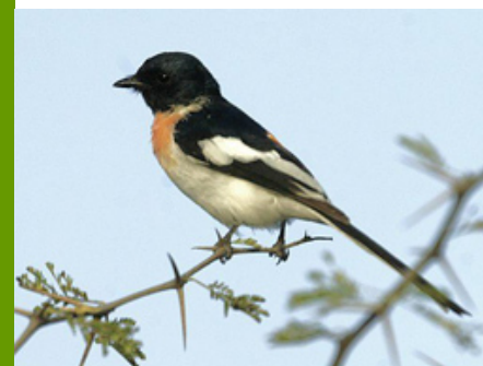
White-bellied Minivet