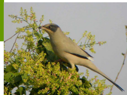
Grey Hypocolius