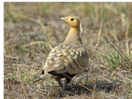
Chestnut-bellied Sandgrouse