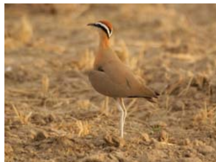
Indian Courser